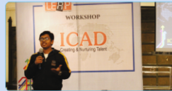
Feedback session by workshop attended participants