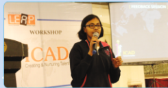
Feedback session by workshop attended participants