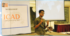
Feedback session by workshop attended participants